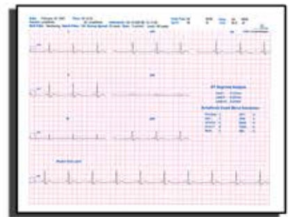
Sample of 5 lead ECG report with ST segment, arrhythmias and vital signs (TV2x and Multi-parameter monitors only)

Digicare's central monitoring and telemetry system CentralVUE™ CV10x is a total new design which connects to multiparameter monitors from the LifeWindow® series and telemetry transmitters from the TeleVUE™ series. This system is the core of Digicare's ECO-SYSTEM of interconnected vital-sign acquisition devices with bi-directional communication to and from the CentralVUE™. A combination of state-of-the-art software design, a super friendly and intuitive user interface with the capability to adjust to several screen sizes including UHD (4k Ultra High Definition) resolutions, makes the CentralVUE™ the most modern and capable veterinary central station and telemetry system on the market today. Channel configurations from 1 to 16 channels makes this system versatile enough to adapt to any clinic size.