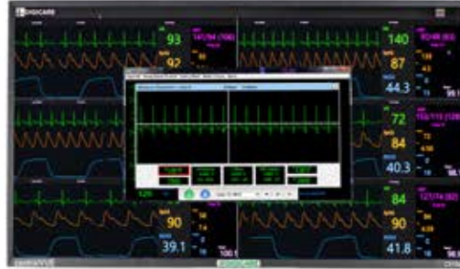
ECG recorder/player has a measurement tool for making several ECG waveform measurements of time and amplitude