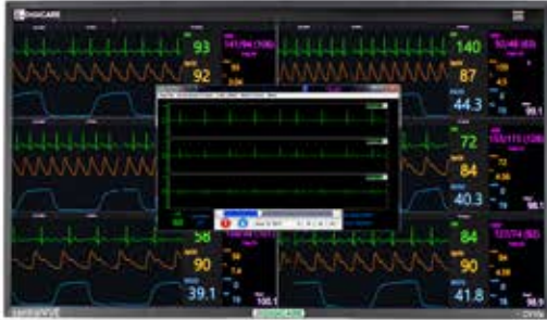
Up to 48 hours recording of any ECG lead with built-in ECG recorder/player and measurements tool